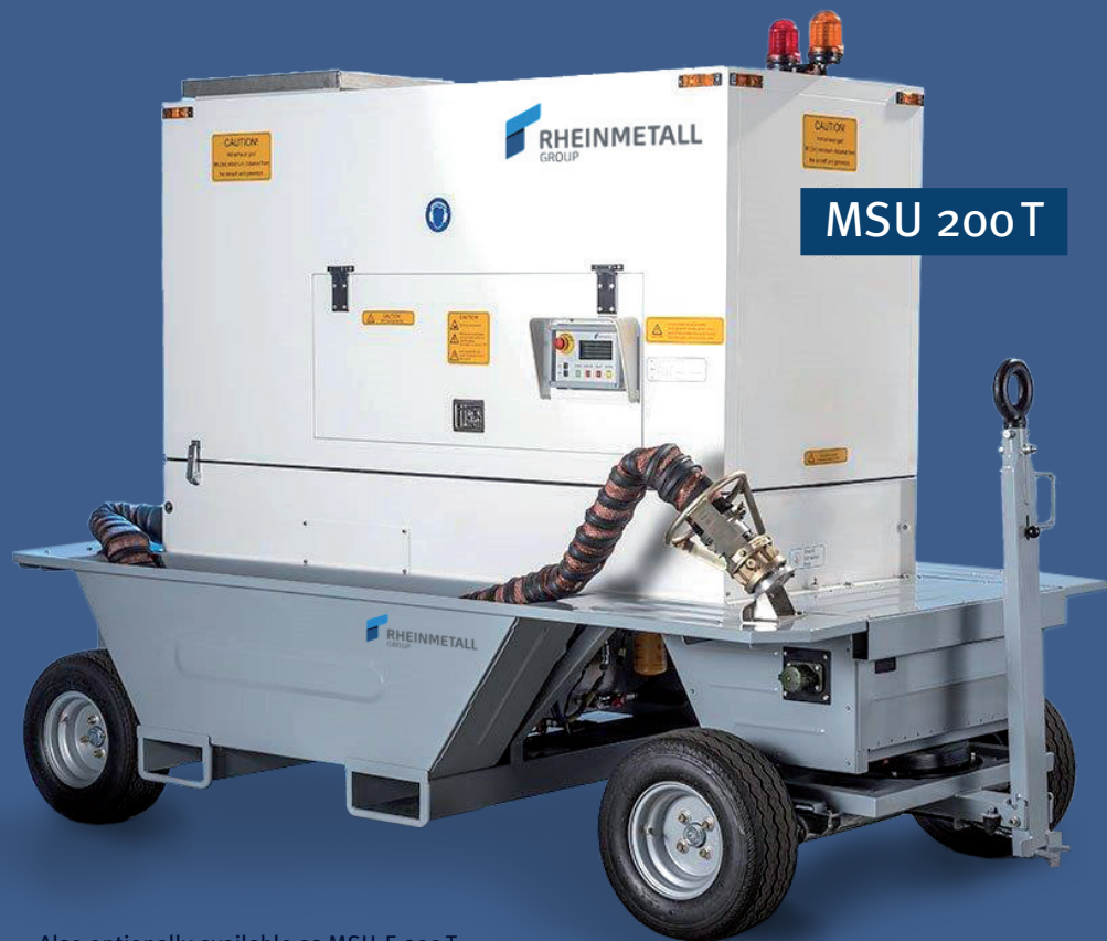
MSU 200 T

Also optionally available as MSU-E 200 T with power supply: 90 kVA / 400 Hz